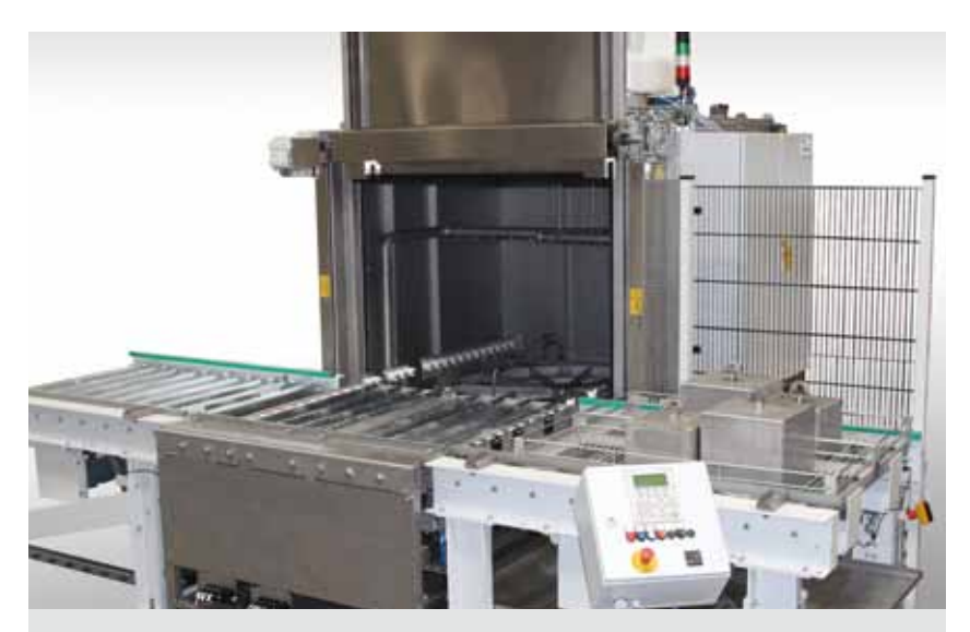
Version: OceanRW with roller conveyor, pneumatic drive-in device and adapted nozzle frame