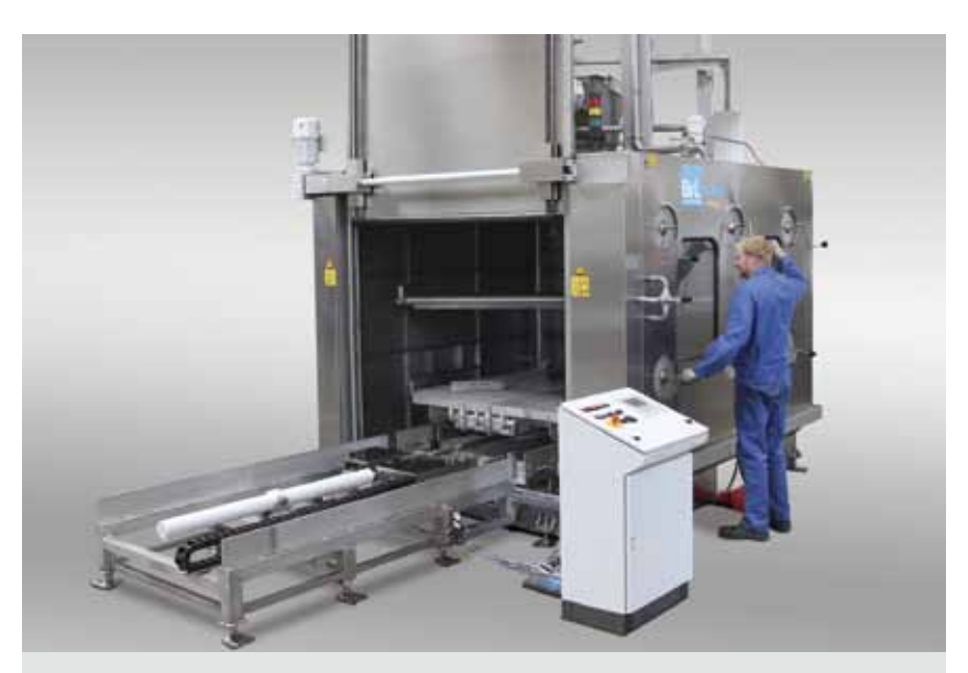
Version: OceanRW with drive-in device, special nozzle frame, manual lances and viewing window; as version for central tank system